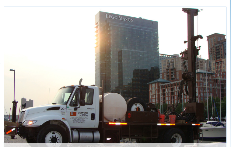
Photo of a drilling rig Used for monitoring well installation. Please do not approach the rig during operations.

The Navy recognizes the potential for the PFCs to continue to move off the NALF Fentress property in the groundwater, which could impact the quality of drinking water for nearby residents who are not currently already impacted. In order to ensure the safety of surrounding residents and to evaluate alternatives for corrective action, the Navy in conjunction with the EPA and VDEQ have developed a strategy for installation of a monitoring well network, which will help define the horizontal and vertical boundaries of the groundwater plume and will allow for continued monitoring of migration potential. Proposed monitoring wells are shown on the figure included on the last page of this fact sheet. Wells are anticipated to be