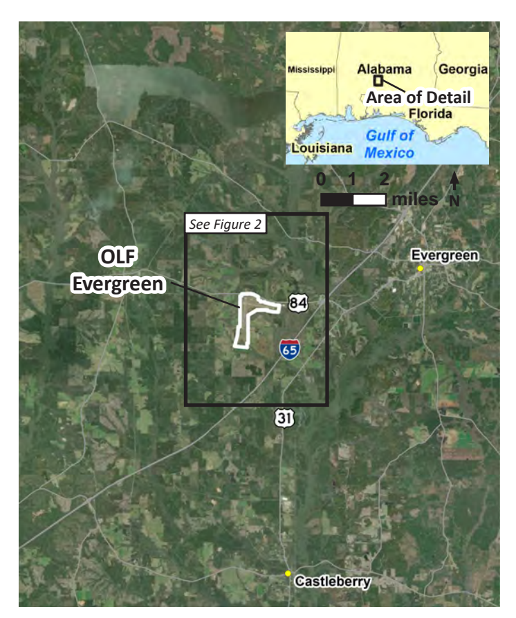
Figure 1 – OLF Evergreen

In 2020, a comprehensive Preliminary Assessment (PA) was completed at the OLFs in Alabama associated with NAS Whiting Field. It identified potential historical releases of firefighting foam to the environment during activities such as testing, training, firefighting, and other life-saving emergency responses. The PA identified one site, the Firehouse/Blockhouse, where