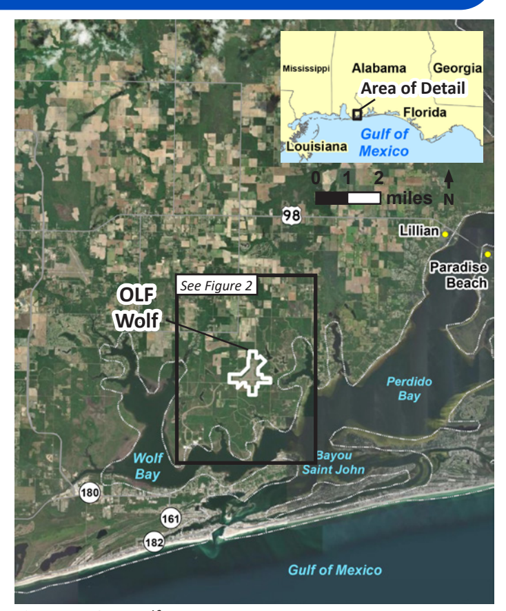
Figure 1 – OLF Wolf

There is no legal requirement to conduct this drinking water testing. The Navy is performing this voluntary testing because