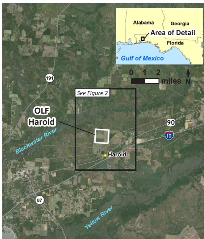
Figure 1 – OLF Harold

In 2020, a comprehensive Preliminary Assessment (PA) was completed at the OLFs associated with NAS Whiting Field. It identified potential historical releases of firefighting foam to the environment during activities such as testing, training, firefighting, and other life-saving emergency responses. The PA confirmed that firefighting foam was released to the