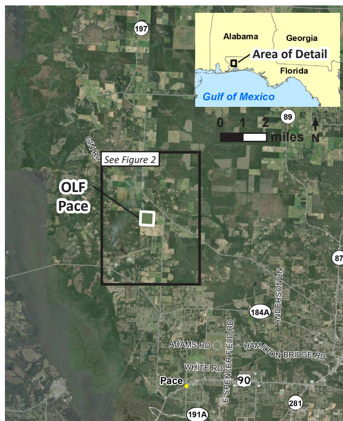
Figure 1 – OLF Pace

In 2020, a comprehensive Preliminary Assessment (PA) was completed at the OLFs in Florida associated with NAS Whiting Field. It identified potential historical releases