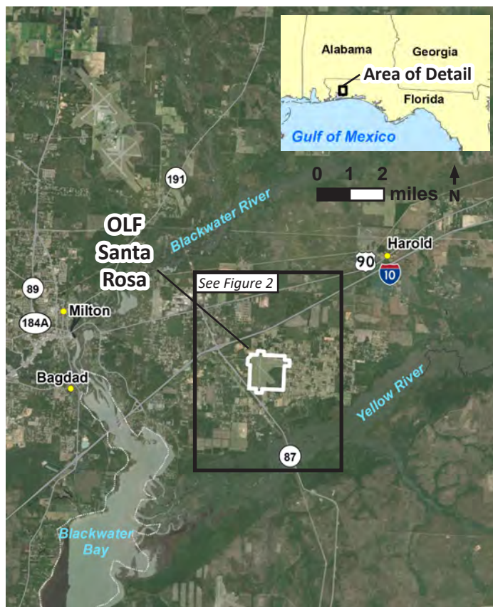
Figure 1 – OLF Santa Rosa

In 2020, a comprehensive Preliminary Assessment (PA) was completed at the OLFs in Florida associated with NAS Whiting Field. It identified potential historical releases of firefighting foam to the environment during activities such as testing, training, firefighting, and other life-saving emergency responses. The PA confirmed that firefighting foam was released to the environment at one site, the Firehouse/Blockhouse. It also identified additional sites, the Aircraft Mishaps, where