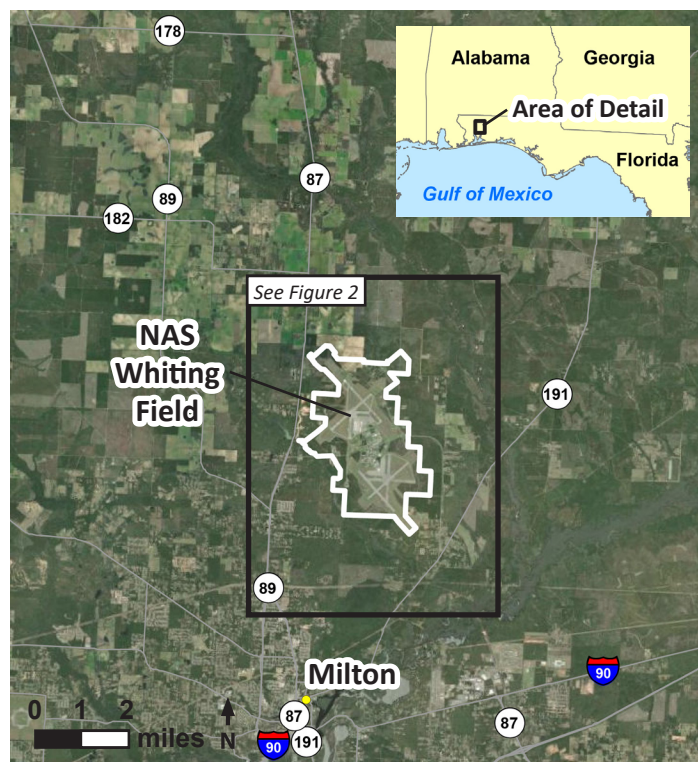
Figure 1 – NAS Whiting Field

The Navy has conducted extensive, basewide research that has identified additional areas at NAS Whiting Field where AFFF may have been released to the environment; therefore, additional drinking