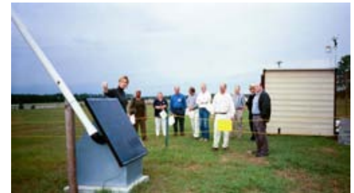
Solar Remediation System Unit at Site 4

Following adjournment of the meeting everyone was invited to the Wings Inn Courtyard for barbecued chicken and hamburgers. A good time was enjoyed by all!