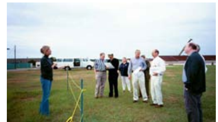
Site Tour at Site 4

This progress report is produced by NAS Whiting Field to keep you informed about the Installation Restoration Program at NAS Whiting Field.