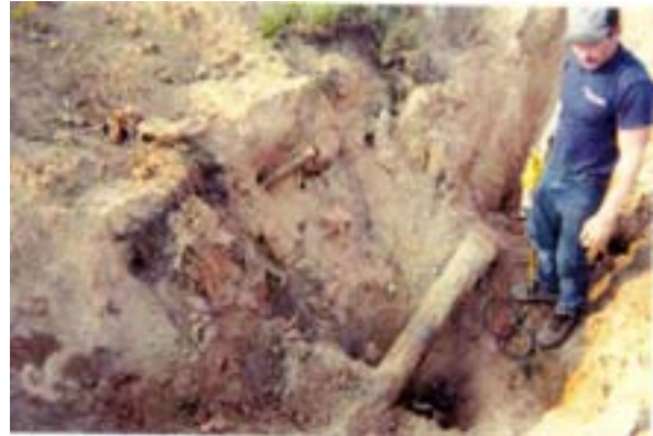
Abandoned Aviation Gasoline Pipeline

The April 2001 Contamination Closure Assessment of a two-mile long abandoned aviation gasoline pipeline, identified four separate petroleum contaminated areas, Sections "A", "B", "E", and "F". The NAS Whiting Field Underground Storage Tank (UST) & IR Programs combined efforts to effectively address the contamination at the pipeline.