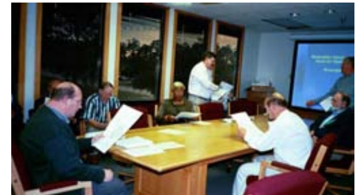
RAB Meeting Technical Program