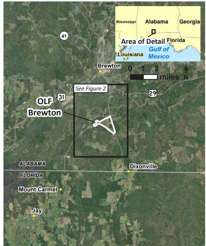
Figure 1 – OLF Brewton

In 2020, a comprehensive Preliminary Assessment (PA) was completed at the OLFs in Alabama associated with NAS Whiting Field. It identified potential historical releases of firefighting foam to the environment during activities such as