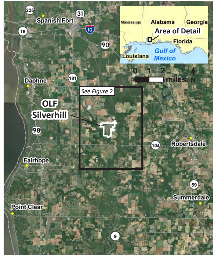
Figure 1 – OLF Silverhill

In 2020, a comprehensive Preliminary Assessment (PA) was completed at the OLFs in Alabama associated with NAS Whiting Field. It identified potential historical releases of