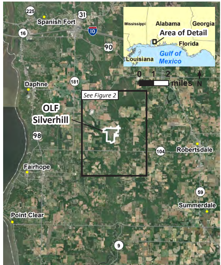
Figure 1 – OLF Silverhill

In 2020, a comprehensive Preliminary Assessment (PA) was completed at the OLFs in Alabama associated with NAS Whiting Field. It identified potential historical releases of firefighting foam to the environment during activities such as testing, training, firefighting, and other life-saving emergency responses. The PA identified two sites, the Firehouse/Blockhouse and the