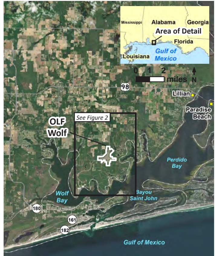
Figure 1 – OLF Wolf

In 2020, a comprehensive Preliminary Assessment (PA) was completed at the OLFs in Alabama associated with NAS Whiting Field. It identified potential historical releases of