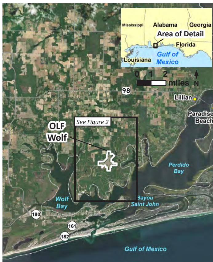
Figure 1 – OLF Wolf

There is no legal requirement to conduct this drinking water testing. The Navy is performing this voluntary testing because it is important