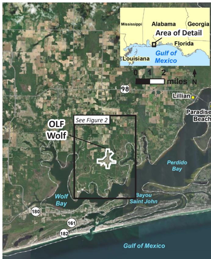
Figure 1 – OLF Wolf

There is no legal requirement to conduct this drinking water testing. The Navy is performing this voluntary testing because