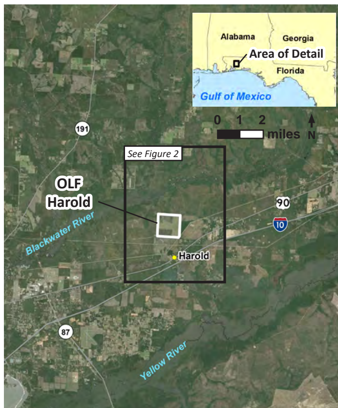
Figure 1 – OLF Harold

In 2020, a comprehensive Preliminary Assessment (PA) was completed at the OLFs in Florida associated with NAS Whiting Field. It identified potential historical releases of firefighting foam to the environment during activities such as testing, training, firefighting, and other life-saving emergency responses. The PA confirmed that firefighting foam was released to the environment at one site, the Firehouse/Blockhouse. At this