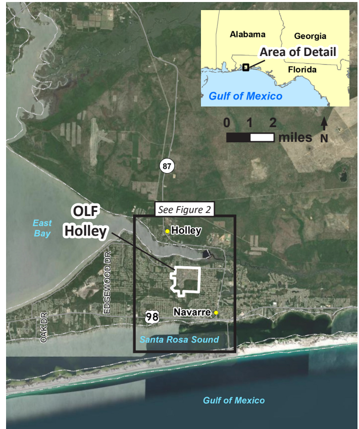
Figure 1 – OLF Holley

In 2020, a comprehensive Preliminary Assessment (PA) was completed at the OLFs in Florida associated with NAS Whiting Field. It identified potential historical releases of