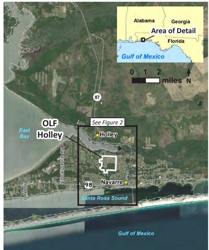
Figure 1 – OLF Holley

In 2020, a comprehensive Preliminary Assessment (PA) was completed at the OLFs in Florida associated with NAS Whiting Field. It identified potential historical releases of firefighting foam to the environment during activities such as testing, training, firefighting, and other life-saving emergency responses. The PA identified two sites, the Firehouse/Blockhouse and the Former Burn Pile, where firefighting foam may have been released to the environment. At each of these sites, PFAS may