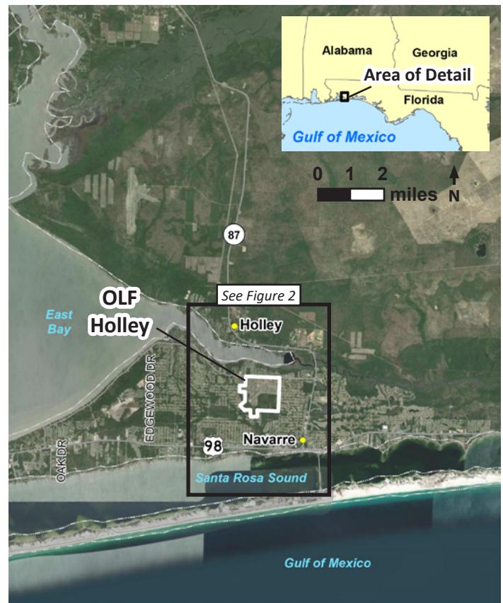
Figure 1 – OLF Holley

In 2020, a comprehensive Preliminary Assessment (PA) was completed at the OLFs associated with NAS Whiting Field. It identified potential historical releases of firefighting foam to the environment during activities such as testing, training, firefighting, and other life-saving emergency responses. The