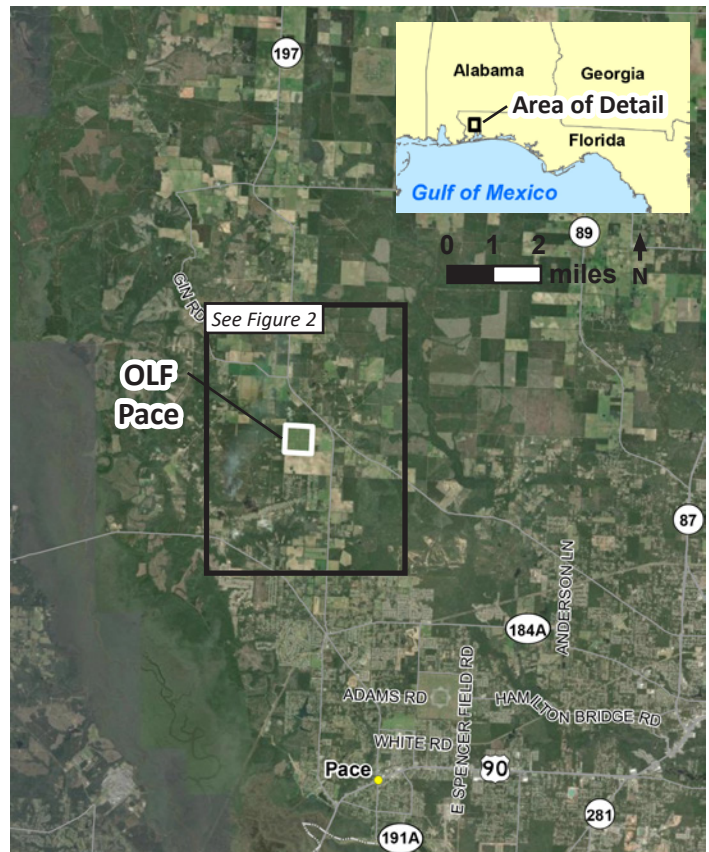
Figure 1 – OLF Pace

In 2020, a comprehensive Preliminary Assessment (PA) was completed at the OLFs associated with NAS Whiting Field. It identified potential historical releases of firefighting foam to the environment during activities such as testing, training, firefighting, and other life-saving emergency responses. The PA identified one site, the Firehouse/Blockhouse, where AFFF may have been released to the environment. At this site,