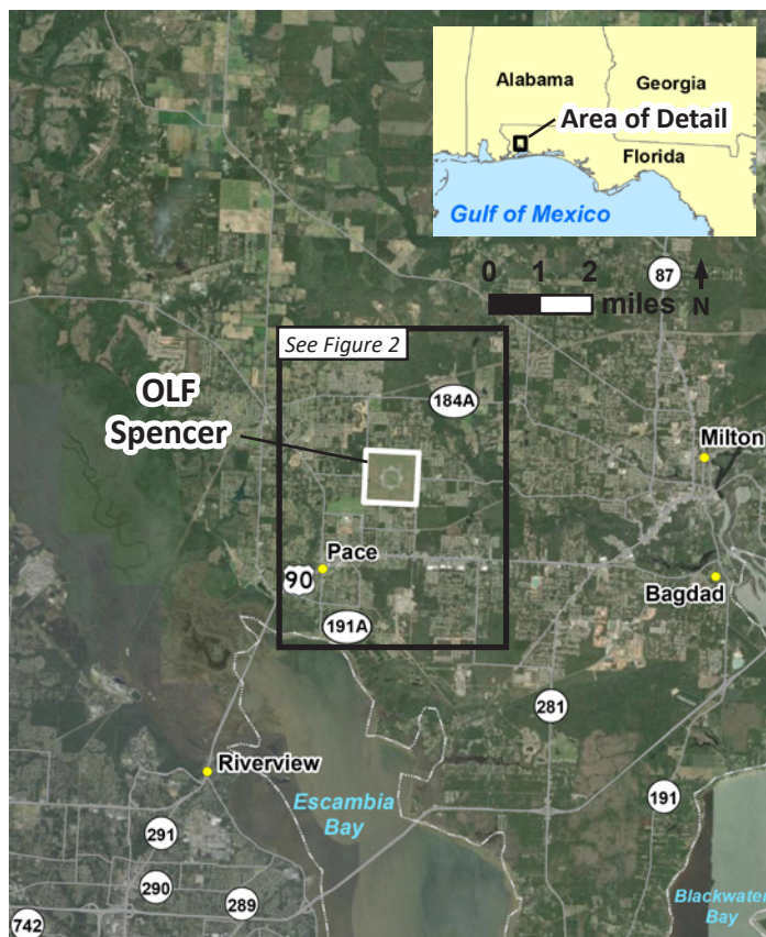
Figure 1 – OLF Spencer

In 2020, a comprehensive Preliminary Assessment (PA) was completed at the OLFs associated with NAS Whiting Field. It identified potential historical releases of firefighting foam to the environment during activities such as testing, training, firefighting, and other life-saving emergency responses. The PA identified three sites, the 2005 Aircraft Mishap, the 2016 Hard Landing, and the Firehouse/Blockhouse,