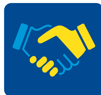
Influencing and Negotiating