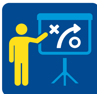
Communicating for Results