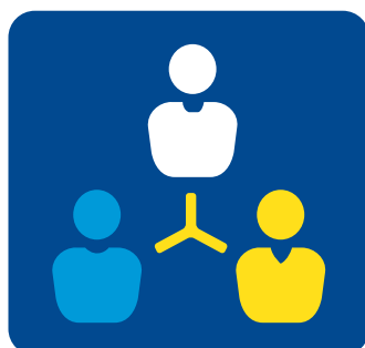
Building Diverse Teams