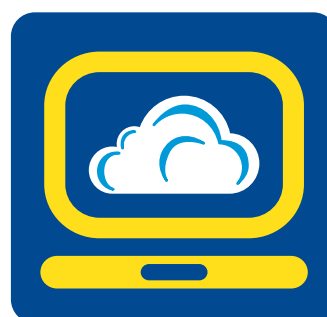
Technology and Data Management