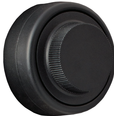
New X/CDX-10 Black Matte