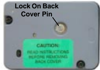
Figure 1 - Lock On Back Cover