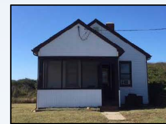
Figure 3 – Top: Building 522; Middle Left: Building 317; Middle Right: Building 405; Bottom Left & Right: Representative examples of cottages

The Navy is accepting comments on the proposed project and Draft PA for 30 days from the date of publication. For more information on the proposed project, or to obtain a copy of the Draft PA, please contact: