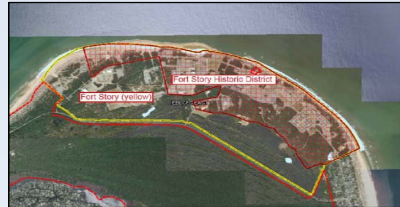
Figure 2 – Proposed Area of Potential Effect Map

Architectural surveys at JEBFS performed in 1999, 2001 and 2012 identified the Fort Story Historic District as eligible for listing on the National Register of Historic Places. Buildings 317, 405, 522, 705, 712, 713, 714, 715, 716, 717, 719 and 721 were identified as contributing resources to the historic district.